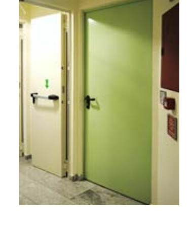
Panicbar, Auter Door Hadle